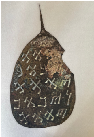
Samaritanisches Heilamulett, Freiburg/Fribourg, Bibel+Orient Museum, VT 2001.1

Workshops: May 2024 , University of Marburg, „Materialität: magisch wirksame Schrifträger“; Nov. 2024 University of Basel, "Performativity / Ritual / Formulas / Language"; Apr. 2025 , University of Leipzig, "Self-Empowerment and Legitimation"; Nov. 2025 , University of Hamburg, Maimonides Centre for Advanced Studies, „Wirkprinzipien“; Apr. 2026 HAB Wolfenbüttel, "Knowledge / History of Knowledge / Theory / Natural Science / Philosophy of Nature“; Nov. 2026 University of Greifswald, "Terminology (Magic / Religious practice)" (working titles)