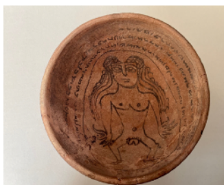
Zauberschale mit Lilith, Cannes, Musée des explorations du monde, 2008.0.229